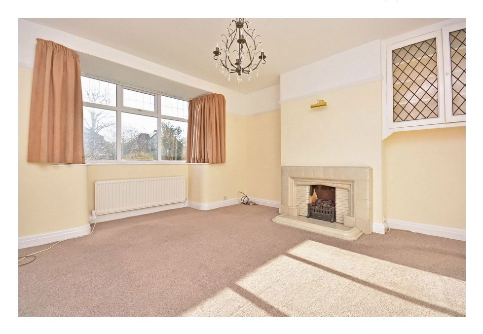
Tax Band: C Furnished: Not specified

**Spacious Two Bedroom Semi-Detached** Located within a short walking distance to Stockton Heath Centre which offers an abundance of amenities. Comprises of: Entrance hallway, modern fitted kitchen, two good sized bedrooms, refurbished bathroom, and gardens to the front and rear. Garden Maintenance included