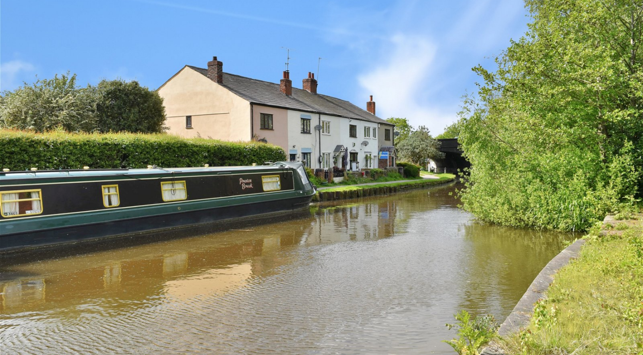
Canalside Cottages, Preston Brook, Cheshire