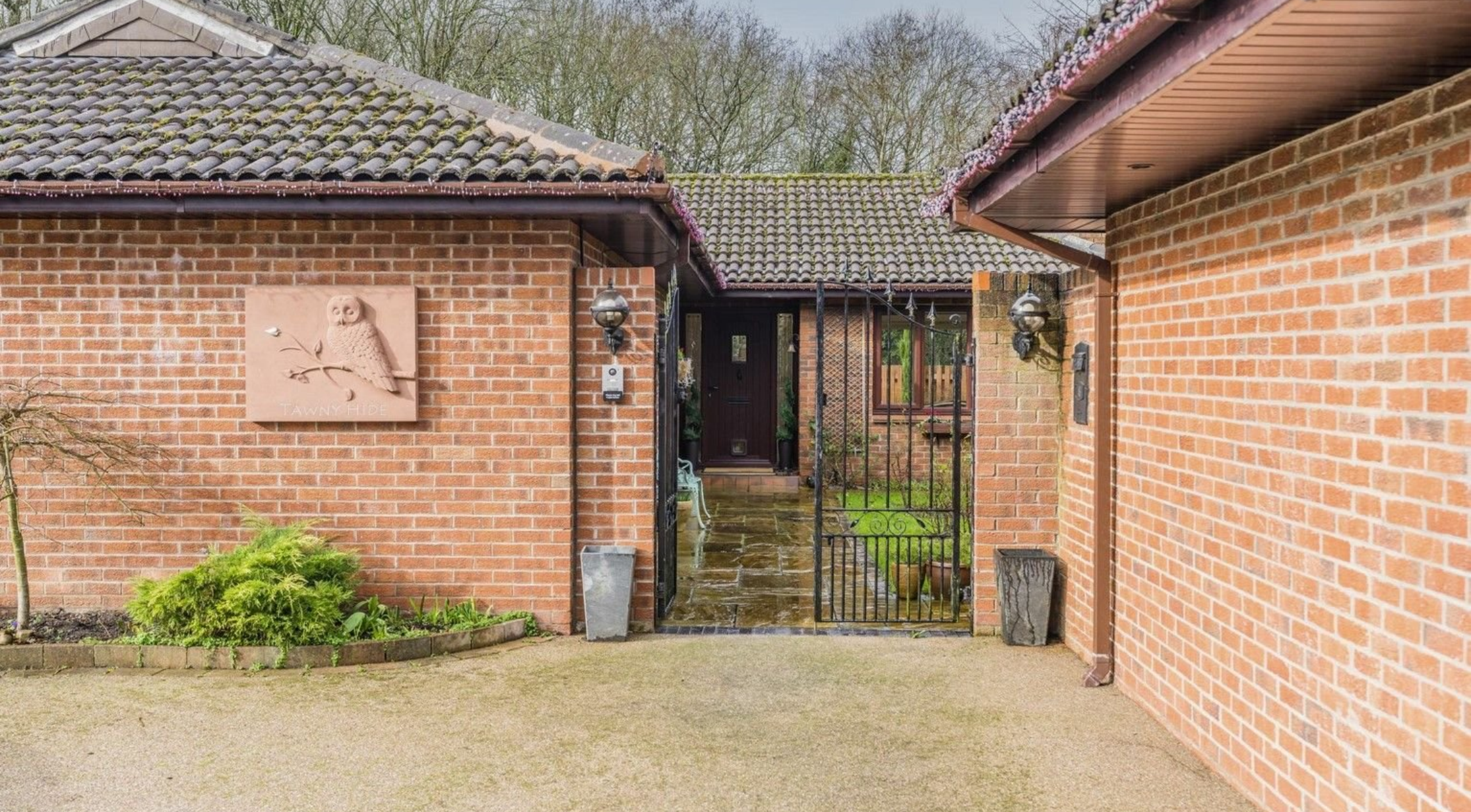
Harrow Close, Appleton, Warrington, WA4 5LX