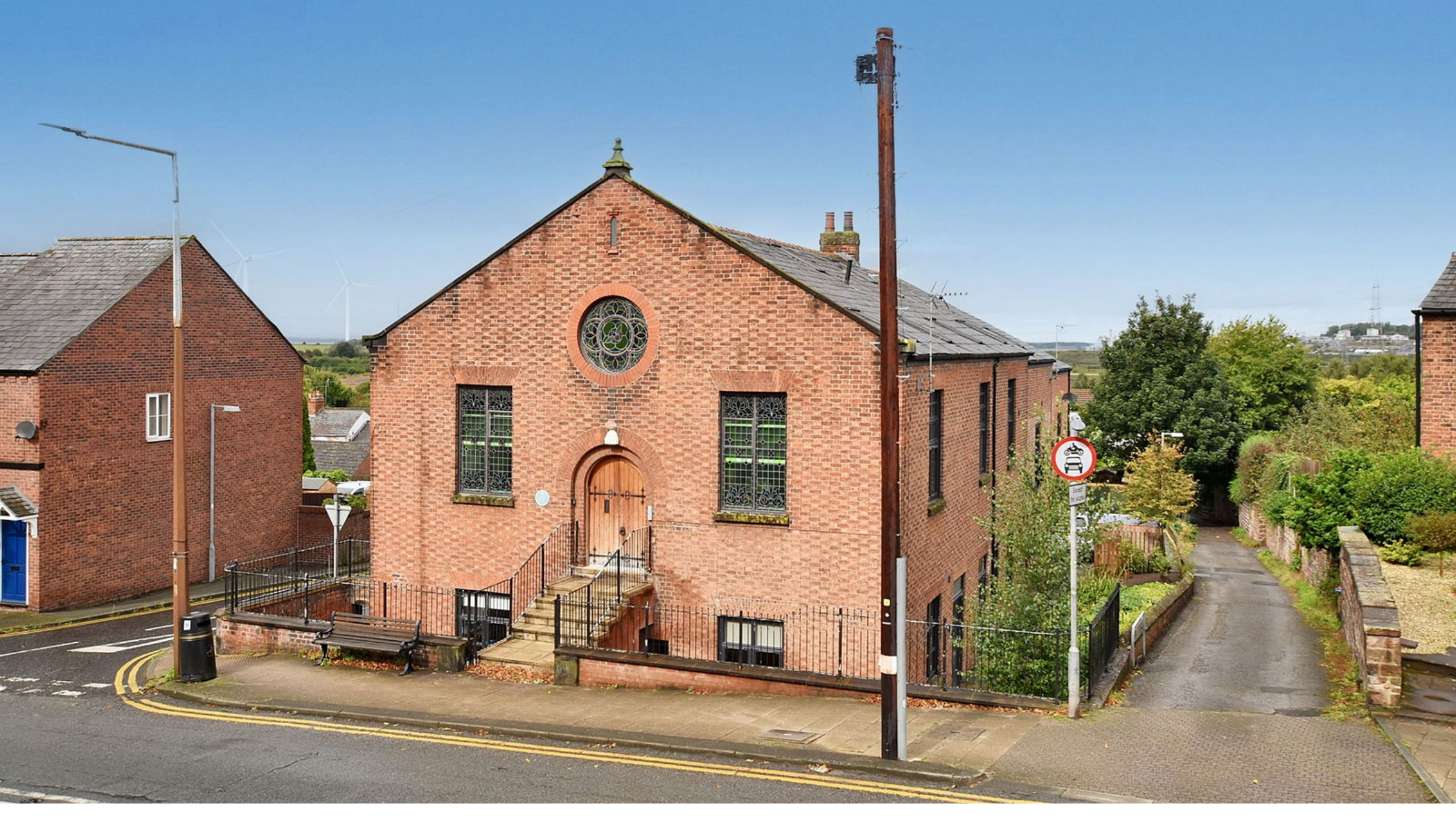
Old Library House, High Street, Frodsham, Cheshire